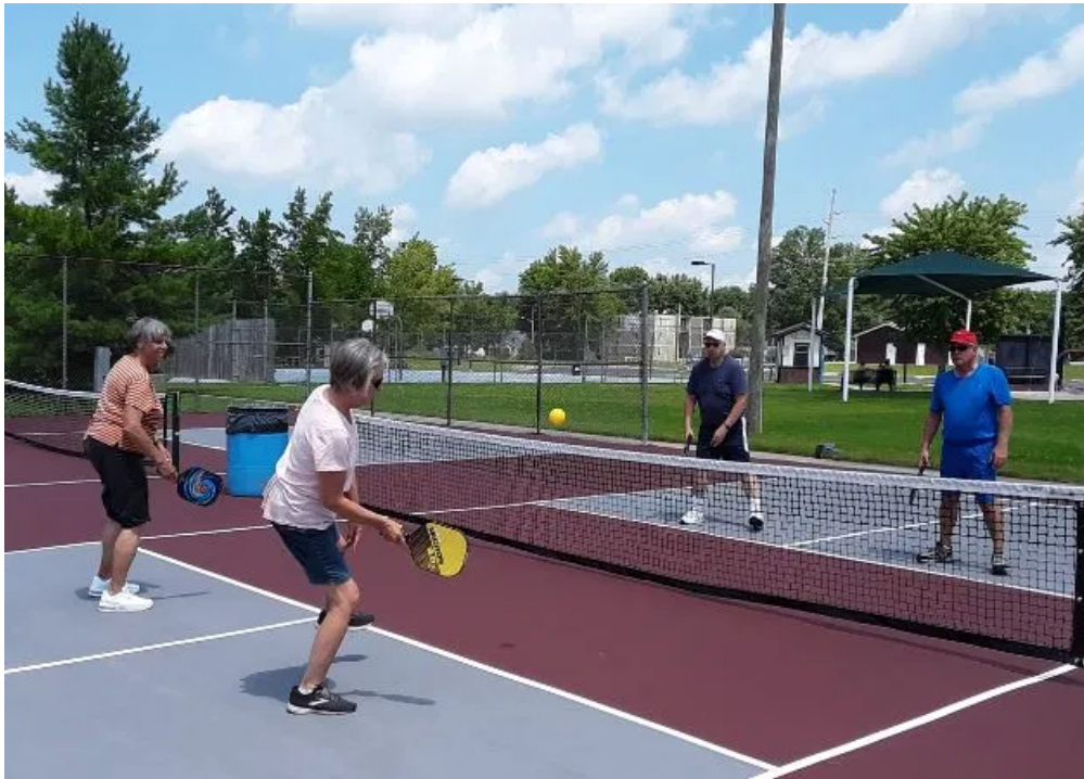
Wellington residents play pickleball on the village's new courts.